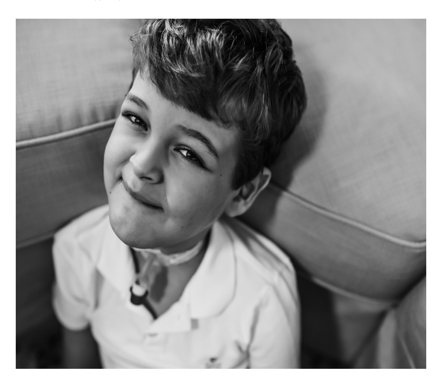
advocating for those with ADEM, AFM, MOG-Ab disease, NMOSD, ON & TM